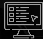
Real-time Audit Trails For Every Action