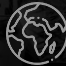
Global Signer Coverage